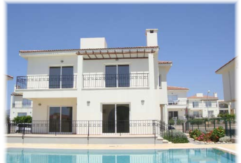
HARMONI VILLAS, HILLTOP VILLAGE, SAFAKOY, BOGAZ